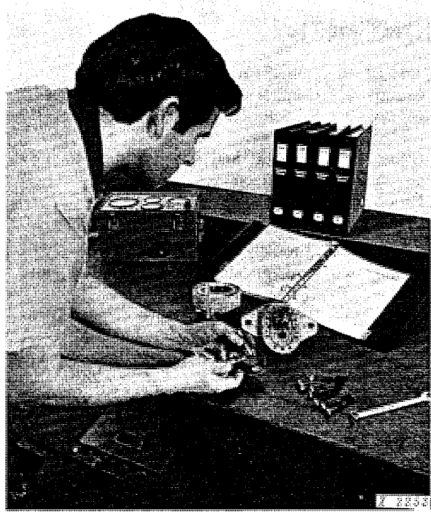
Use Technical Manuals for Actual Service

This technical manual is part of a twin concept of service: